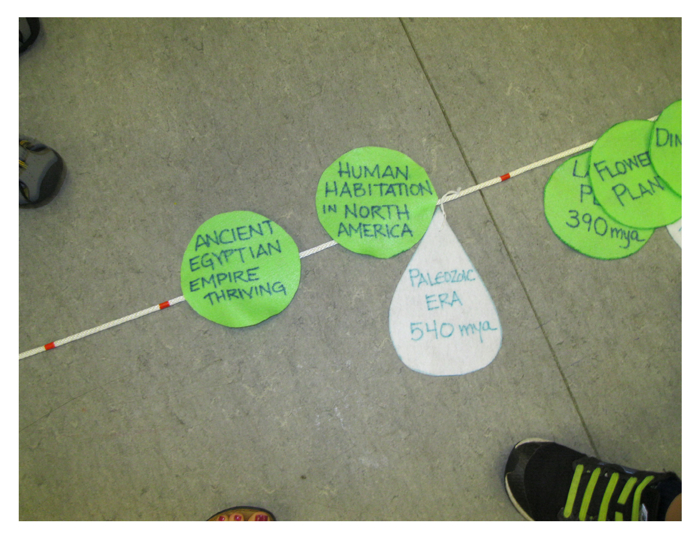
Figure 2. Campers gathering around the Rope to discuss their placement of event markers for human habitation alongside a marker for the Paleozoic Era.

to use a discovery method by letting the children walk around comparing the two ropes. Amy's inquiry approach is reflected in this comment where she emphasizes the role of play and talk for knowledge building for the campers.